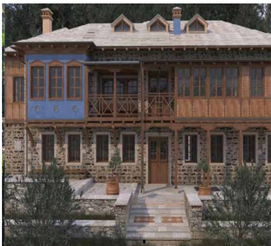
Above left: The old North Wing (left edge of photo) before demolition.